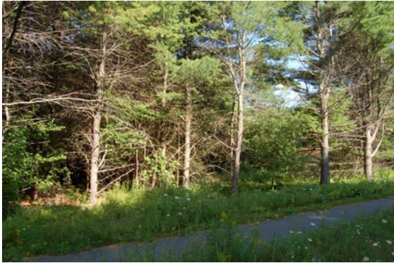
Plate 35: View east of forest. Forest has potential. Requires Stage 2 test-pit survey.