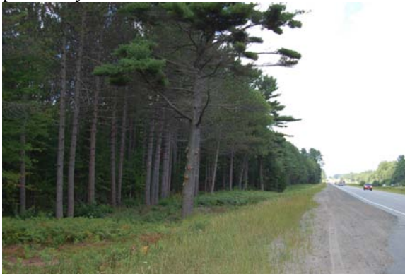
Plate 13: View north along Highway 11. ROW is disturbed; no potential. Forest requires Stage 2 test-pit survey.