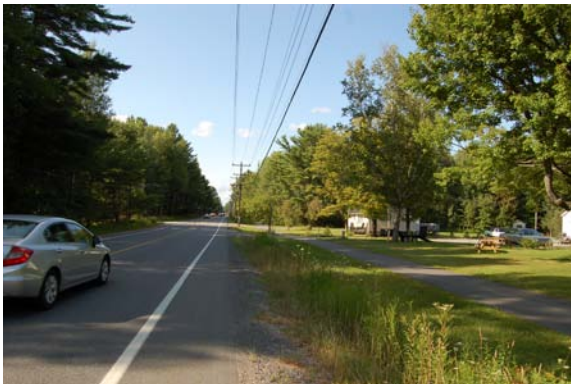
Plate 33: View northwest along Manitoba Street. ROW is disturbed; no potential.