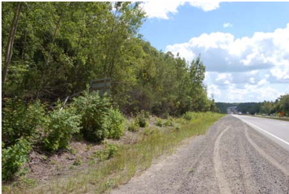
Plate 19: View southeast along Highway 11. ROW is disturbed; no potential. Forest requires Stage 2 test-pit survey.