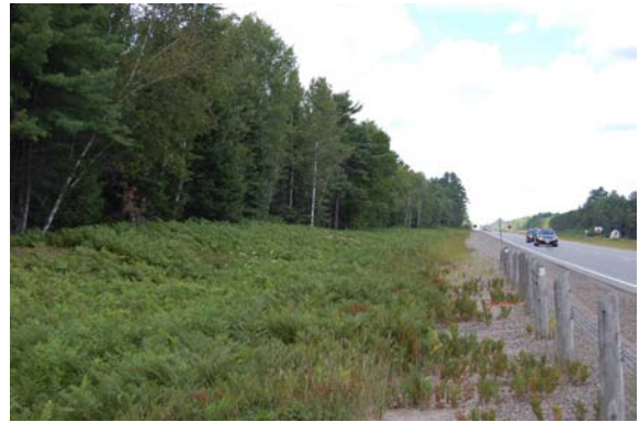
Plate 8: View north along Highway 11. ROW is disturbed. No potential.