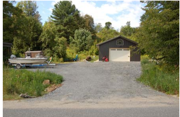
Plate 42: View southwest of gravel yard. Yard is disturbed. No potential.