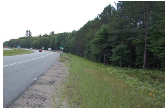
Plate 14: View south along Highway 11. ROW is disturbed; no potential. Forest requires Stage 2 test-pit survey.