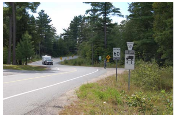
Plate 22: View west along High Falls Road. ROW is disturbed; no potential. Forest north of road has potential. Require Stage 2 test-pit survey.