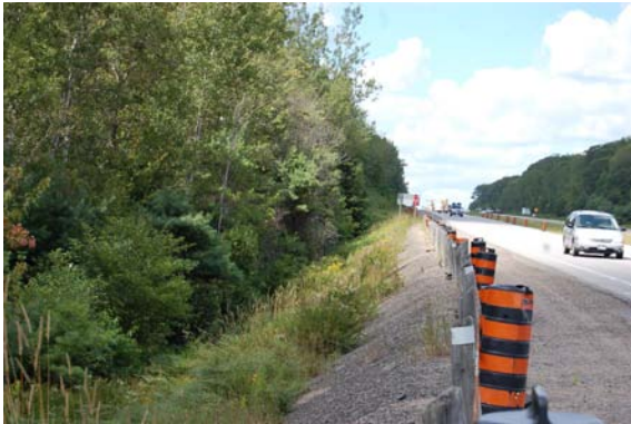
Plate 23: View north-northwest along Highway 11. Row is disturbed; no potential. Bush west of highway requires Stage 2 test-pit survey.