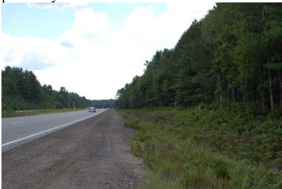
Plate 9: View south along Highway 11. ROW is disturbed. No potential.