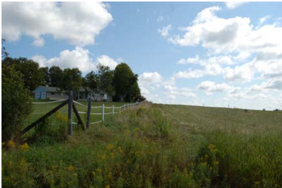
Plate 49: View east of agricultural field. Potential. Requires Stage 2 pedestrian survey.