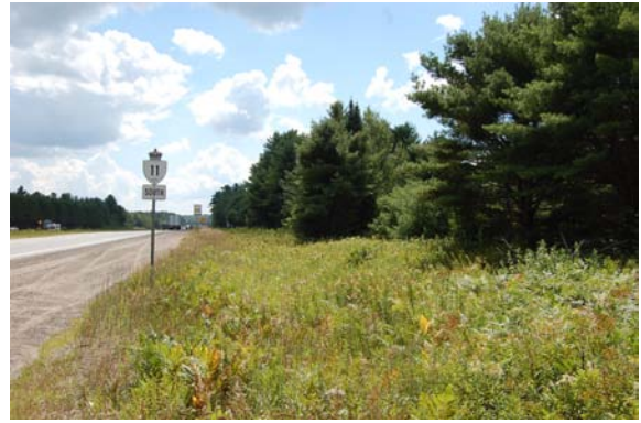
Plate 2: View south along Highway 11. No potential within ROW.