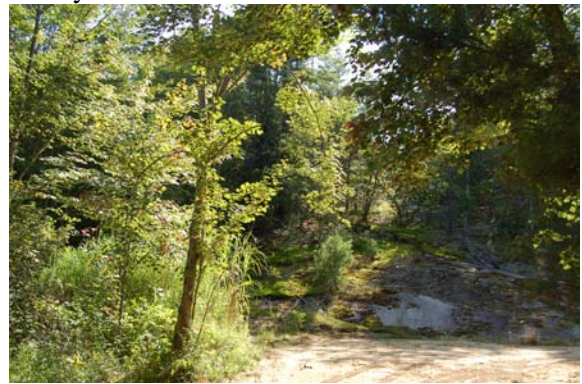
Plate 34: View west of forest. Forest has potential; requires Stage 2 test-pit survey.