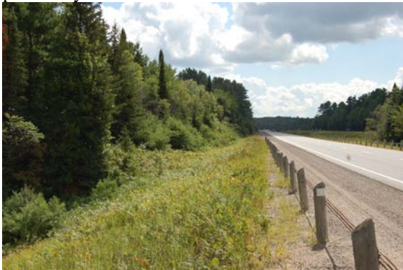
Plate 7: View south along Highway 11. ROW is disturbed; no potential. Forest requires Stage 2 test-pit survey.