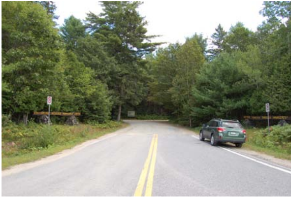
Plate 11: View east of driveway. Drive way is disturbed; no potential. Forest requires Stage 2 test-pit survey.