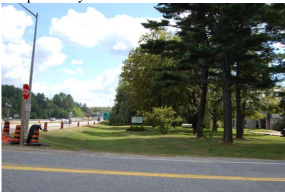
Plate 21: View south-southeast of MNR office and yard. Highway 11 ROW is disturbed; no potential. Lawn has potential; requires Stage 2 test-pit survey. Office complex is disturbed; no potential