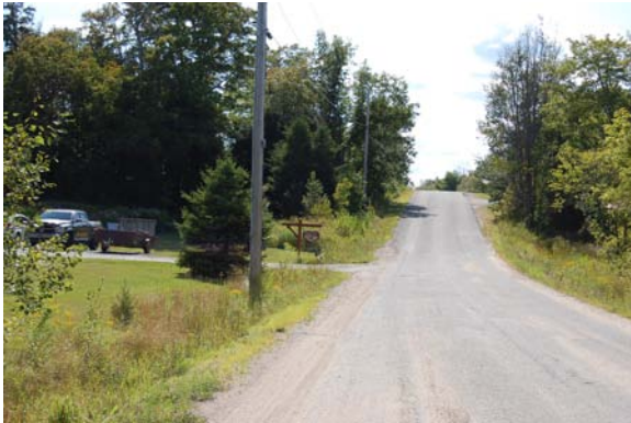
Plate 41: View southwest along Partridge Lane. ROW is disturbed. No potential.