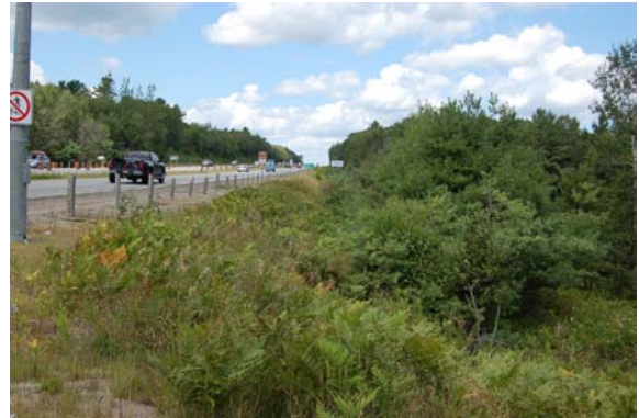
Plate 24: View north-northwest along Highway 11. ROW is disturbed; no potential. Bush east of highway has potential and requires Stage 2 test-pit survey.