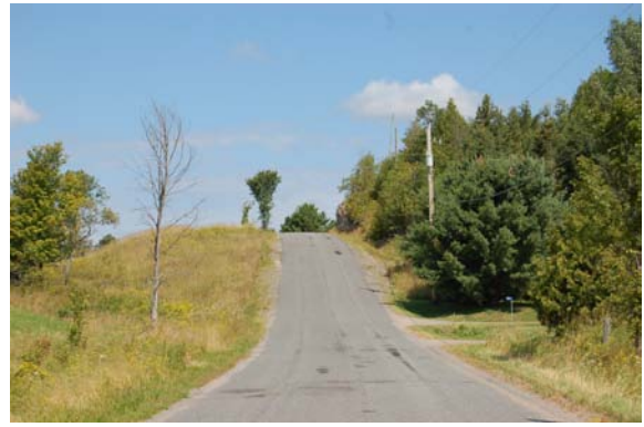
Plate 44: View northwest along South Monck Drive. ROW is disturbed; no potential.