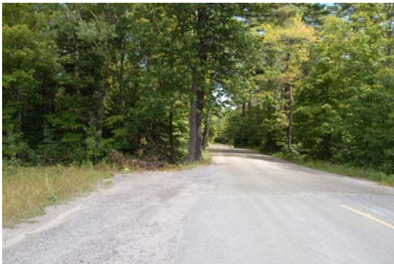
Plate 25: View east along Holiday Park Drive. ROW is disturbed; no potential. Forest requires Stage 2 test-pit survey.