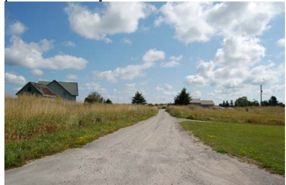
Plate 50: View east of golf course driveway. Driveway is disturbed. No potential.