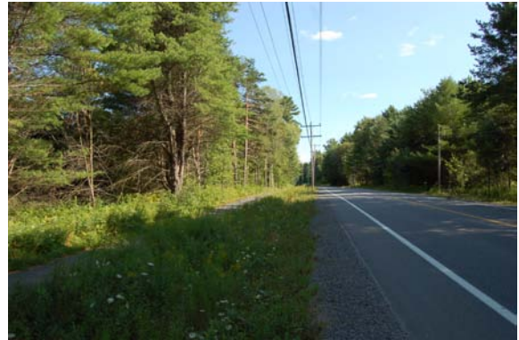
Plate 36: View southeast along Manitoba Street. ROW is disturbed. No potential.