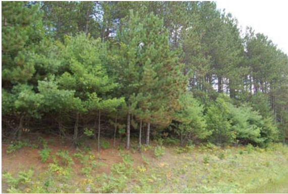
Plate 17: View southeast of forest east of Highway 11. Forest requires Stage 2 test-pit survey.