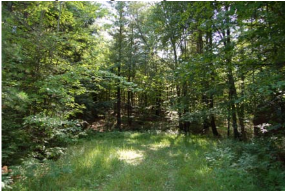
Plate 31: View west of forest. Forest has potential. Requires Stage 2 test-pit survey.