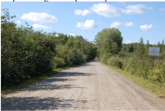
Plate 37: View northwest along South Monck Drive. ROW is disturbed. No potential.