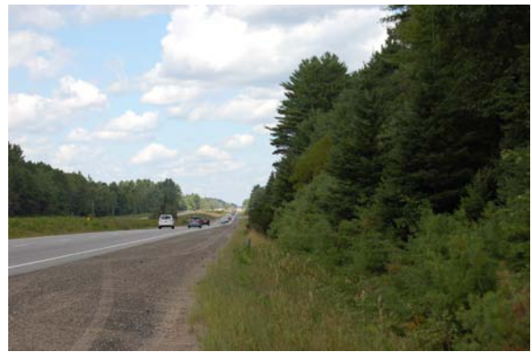
Plate 10: View north along Highway 11. ROW is disturbed; no potential. Forest requires Stage 2 test-pit survey.