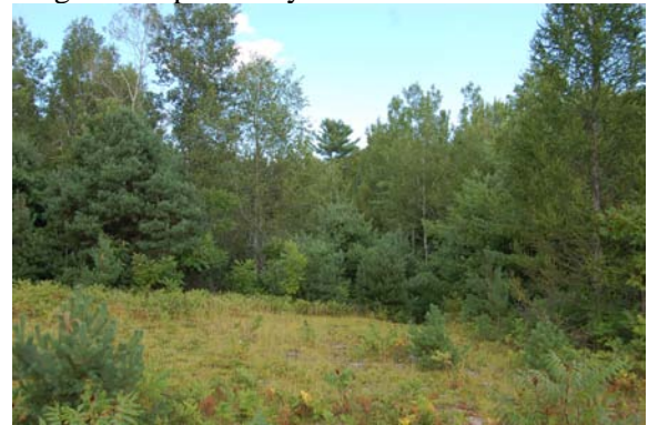
Plate 20: View east of forest. Forest has potential; requires Stage 2 test-pit survey.