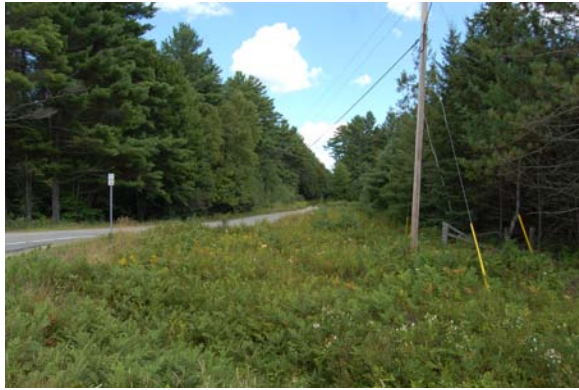
Plate 1: View east-northeast along Alpine Ranch ROW. No potential within ROW.