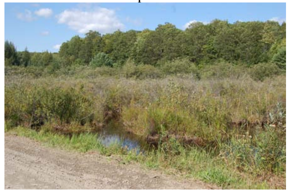
Plate 38: View northeast, of watercourse and marsh. Area is low and wet. No potential.