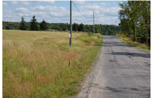
Plate 48: View southeast along South Monck Drive. Field beyond ROW requires Stage 2 pedestrian survey.