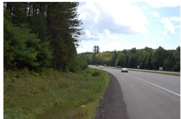
Plate 16: View south along Highway 11/ ROW is disturbed; no potential. Forest requires Stage 2 test-pit survey.