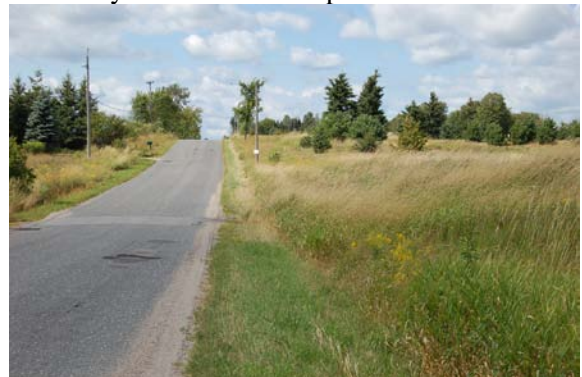
Plate 52: View northwest along South Monck Drive. ROW is disturbed. No potential.