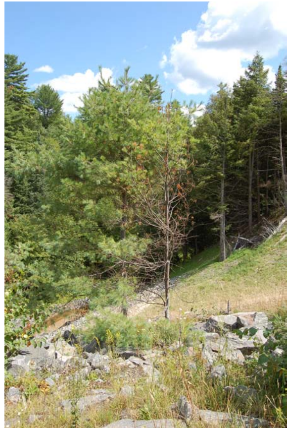
Plate 4: View east of sloped area with no potential. Does not require Stage 2 AA.