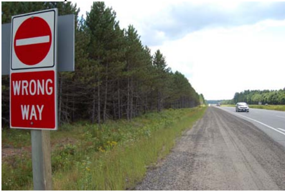
Plate 3: View south along Highway 11. ROW is disturbed; no potential. Forest will require Stage 2 test-pit survey.