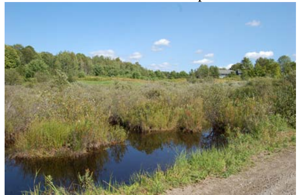
Plate 40: View east, of watercourse and marsh area. Area in foreground is low and wet. No Stage 2 required. Area in background requires Stage 2 test-pit survey.