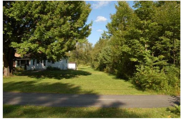
Plate 32: View east of lawn. Lawn and forest have potential. Both require Stage 2 test-pit survey.