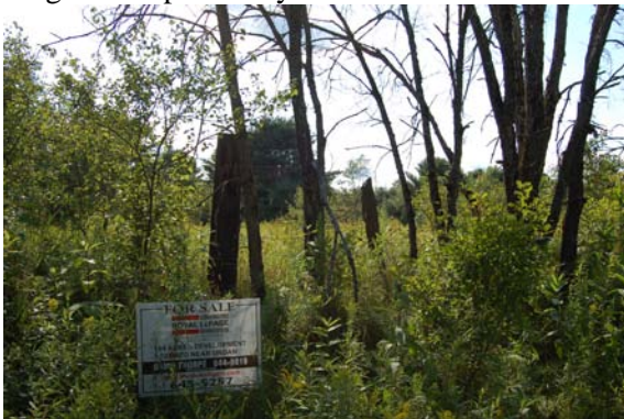
Plate 27: View west of bush area. Area has potential. Requires Stage 2 test-pit survey.