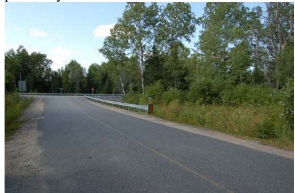
Plate 26: View north along Bonnell Road. ROW is disturbed; no potential. Bush requires Stage 2 test-pit survey.