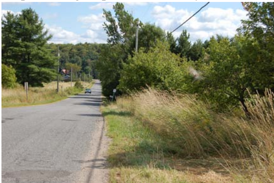
Plate 51: View northwest along South Monck Drive. ROW is disturbed. No potential.