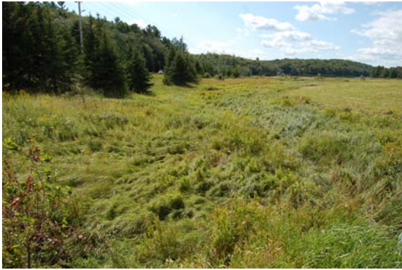
Plate 53: View west, of waterlogged watercourse. Area is low and wet. No Stage 2 required.