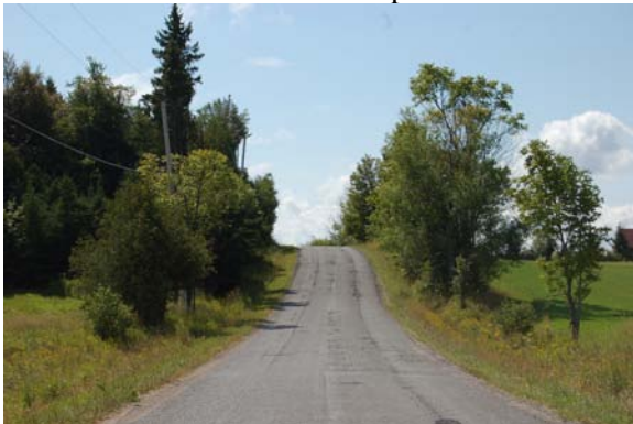
Plate 45: View southeast along South Monck Drive. ROW is disturbed. No potential.