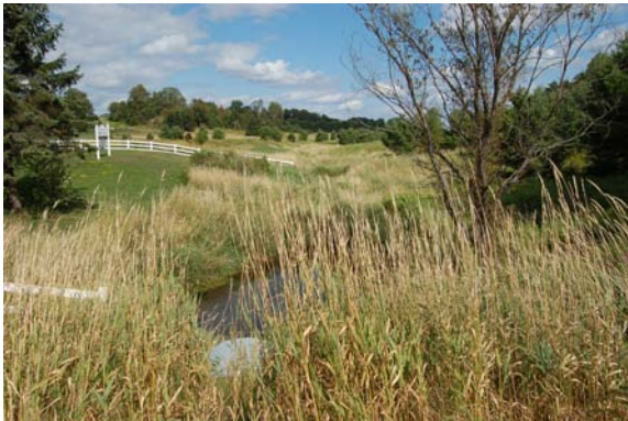
Plate 55: View east along stream course. Area is low and wet. No Stage 2 required.