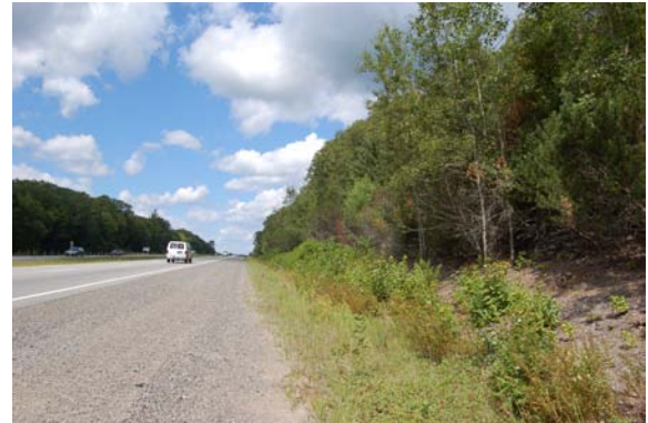
Plate 18: View northwest along Highway 11. ROW is disturbed; no potential. Forest requires Stage 2 test-pit survey.