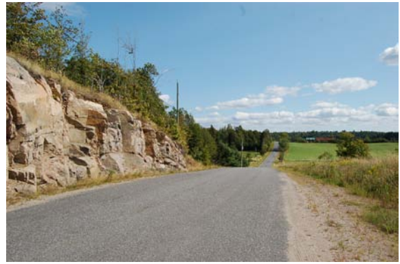
Plate 46: View southeast along South Monck Drive. ROW is disturbed. No potential.