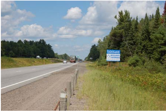
Plate 5: View north along Highway 11. ROW is disturbed; no potential. Forest requires Stage 2 test-pit survey.