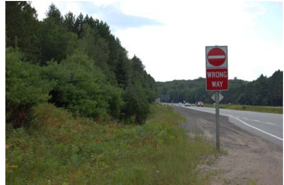
Plate 12: View south along Highway 11. ROW is disturbed; no potential. Forest requires Stage 2 test-pit survey.