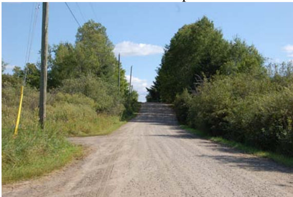
Plate 39: View southeast along South Monck Drive. Row is disturbed. No potential.