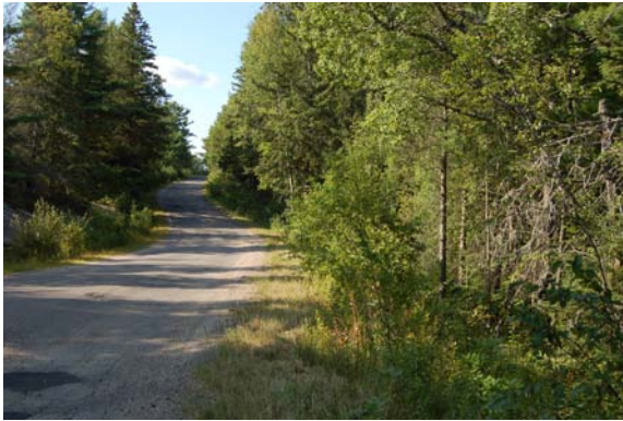
Plate 29: View north along Bonnell Road. ROW is disturbed; no potential. Forest on either side of ROW requires Stage 2 test-pit survey.