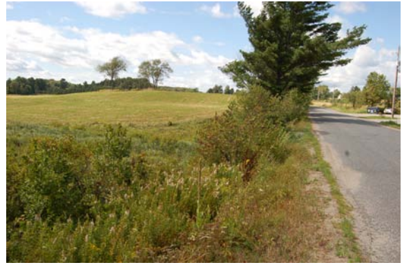
Plate 54: View northwest along South Monck Drive. Agricultural field beyond ROW has potential; requires Stage 2 pedestrian survey.