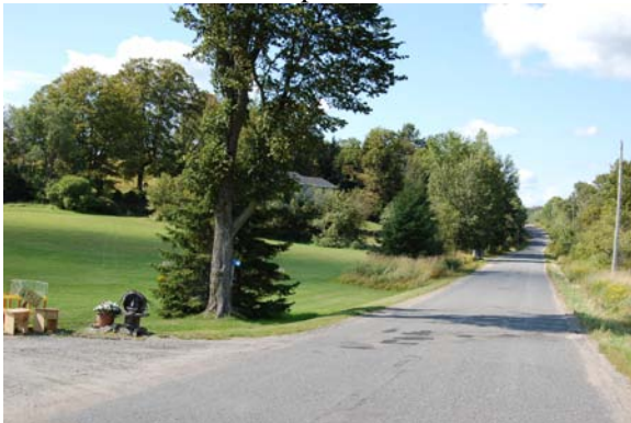
Plate 43: View northwest along South Monck Drive. ROW is disturbed. No potential.