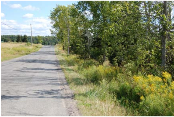
Plate 47: View southeast along South Monck Drive. ROW is disturbed. No potential.