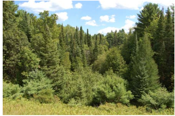
Plate 6: View east of hollow. Area has steep slopes with no potential.