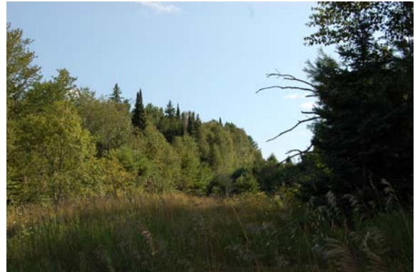
Plate 30: View southeast along Trans-Canada Pipeline easement. Easement is disturbed; no potential. Forest requires Stage 2 test-pit survey.